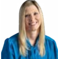
Chelesy Hanes Fike Corporation